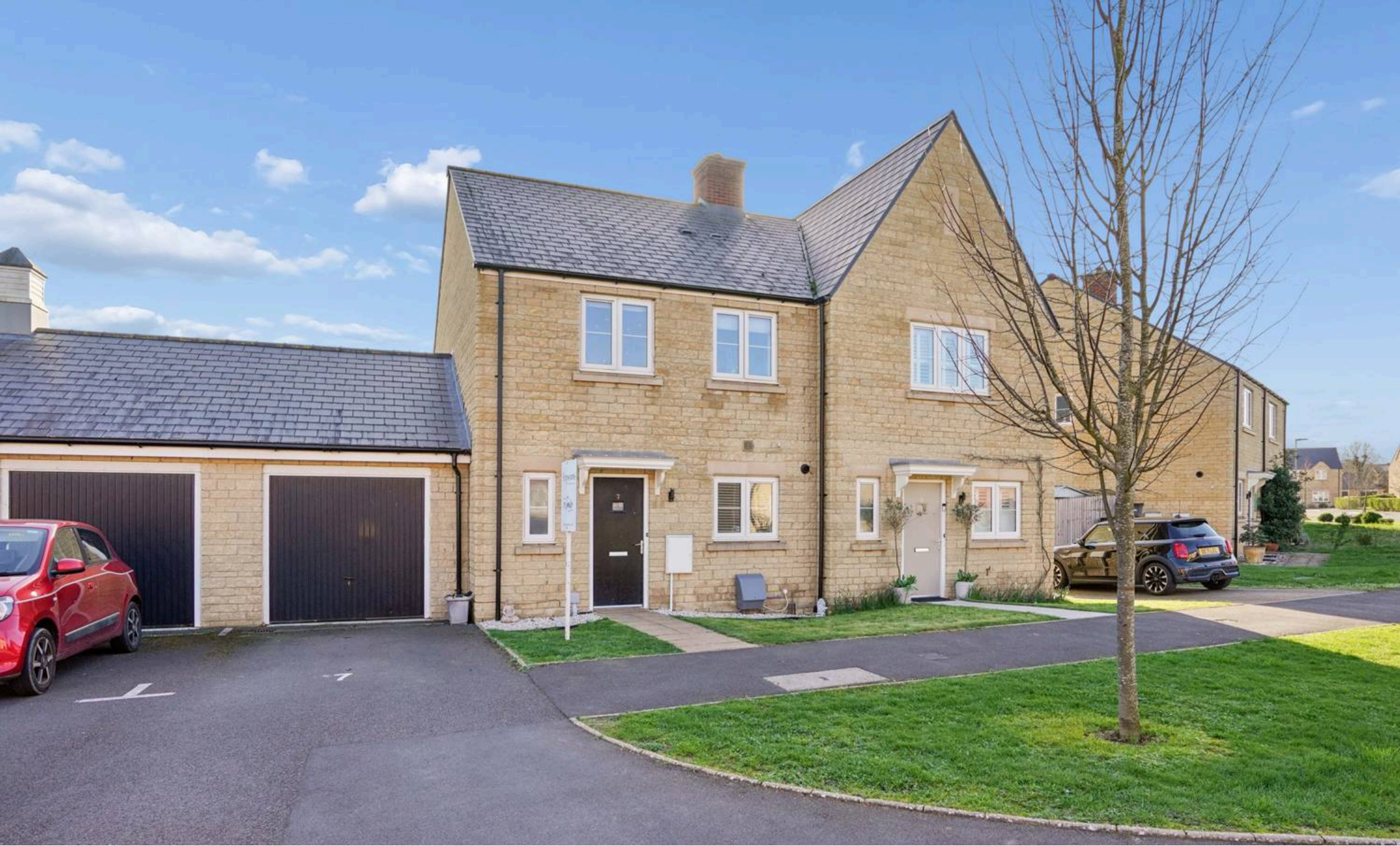
7 Woodley Drive, Bampton