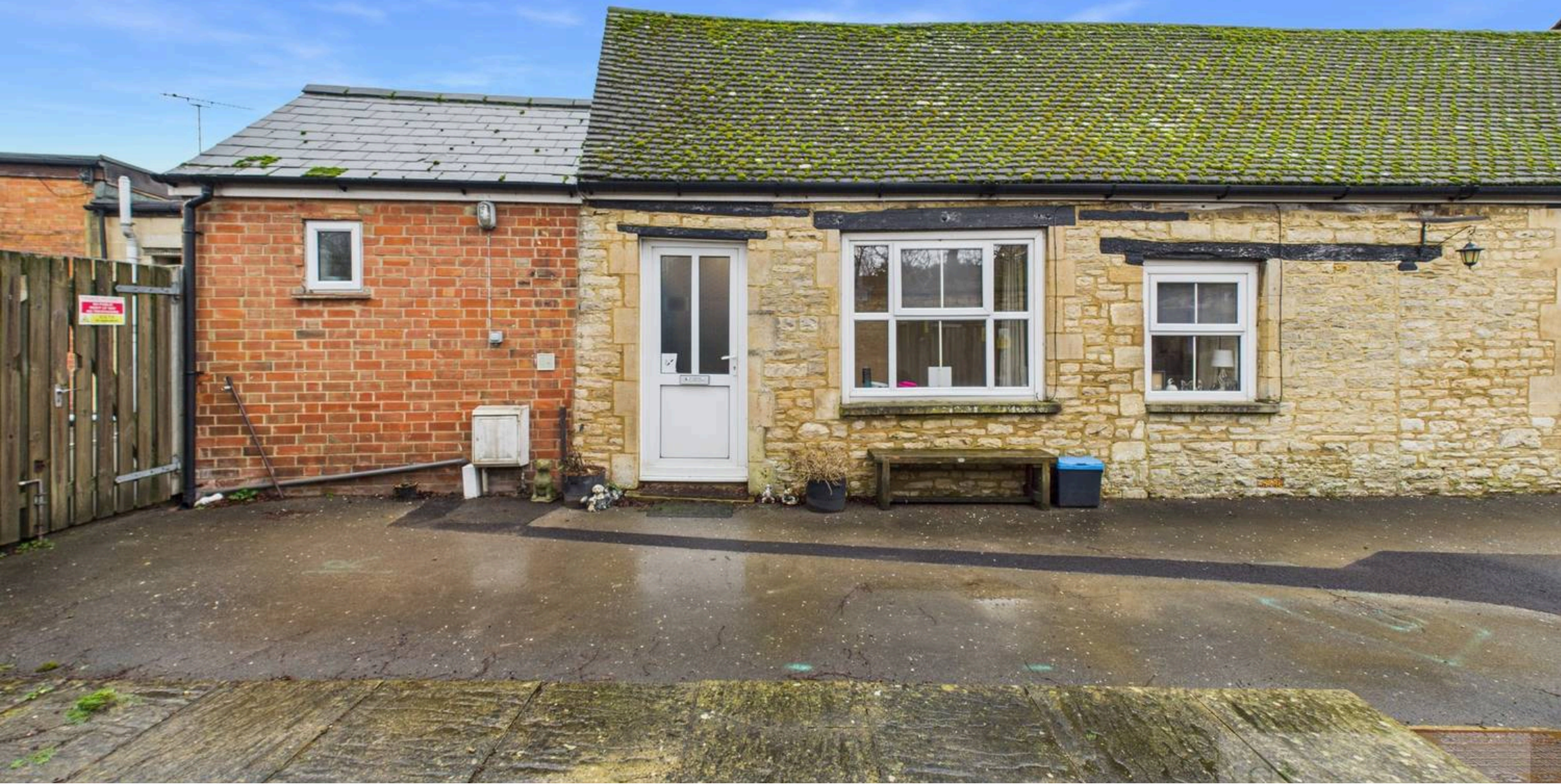
13a Bridge Street, Witney