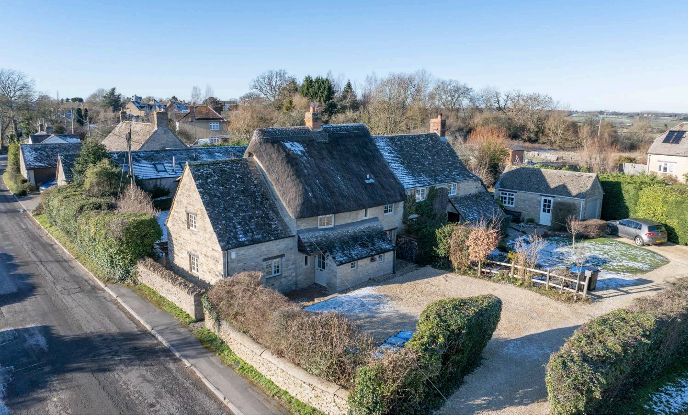
39 Park Road, North Leigh