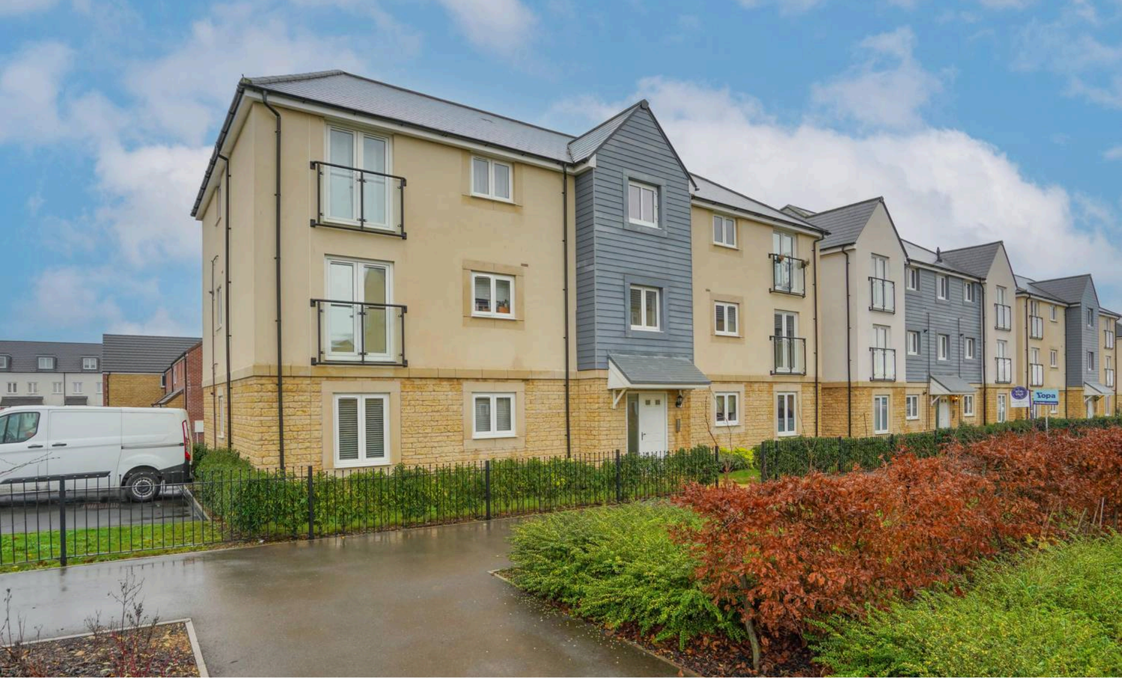
4 Mossie Walk, Witney