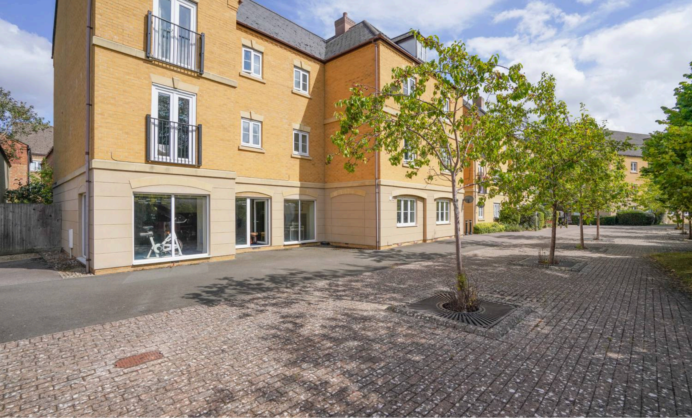
Weavers Bridge House Priory Mill Lane, Witney