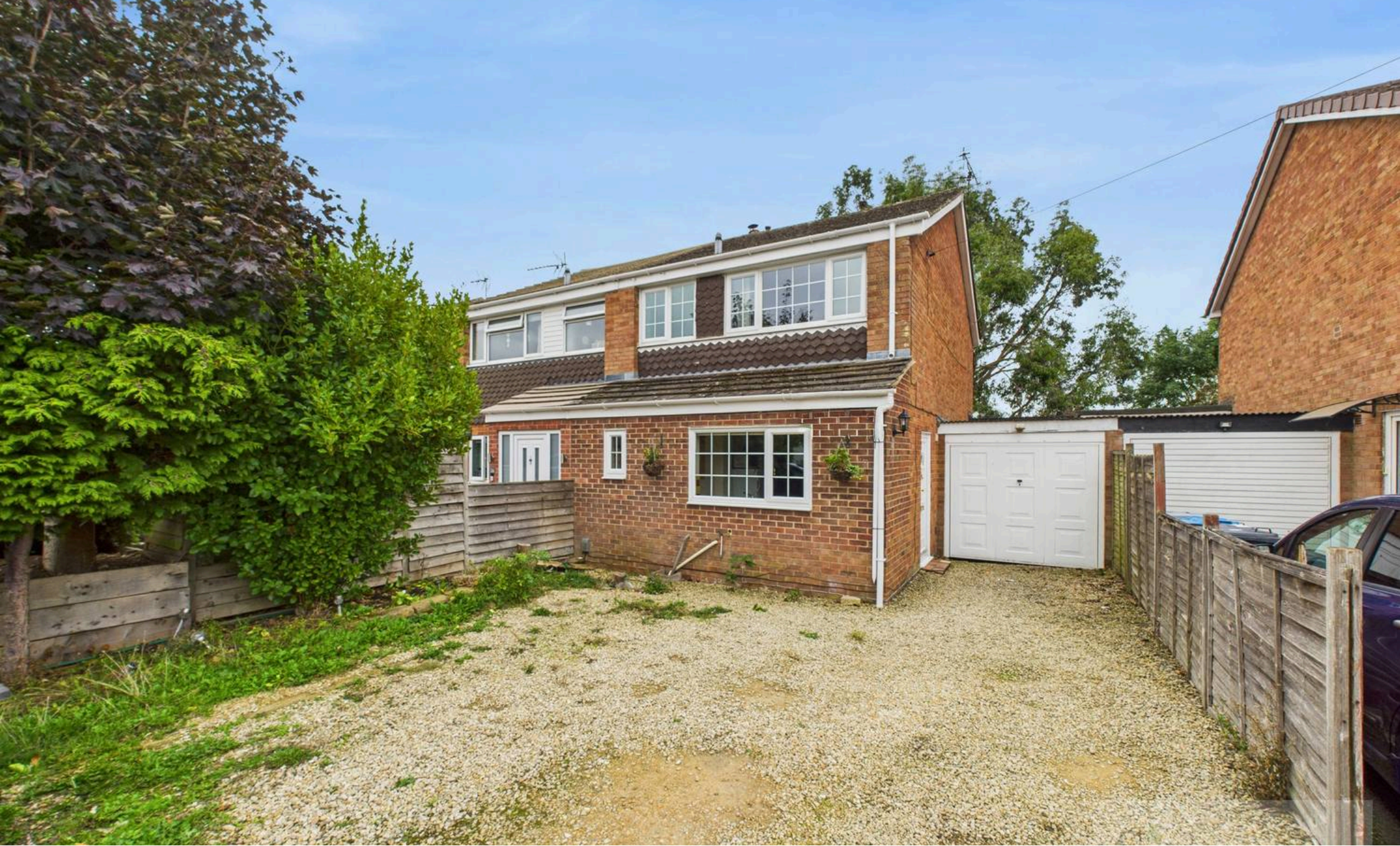
134 Burwell Drive, Witney