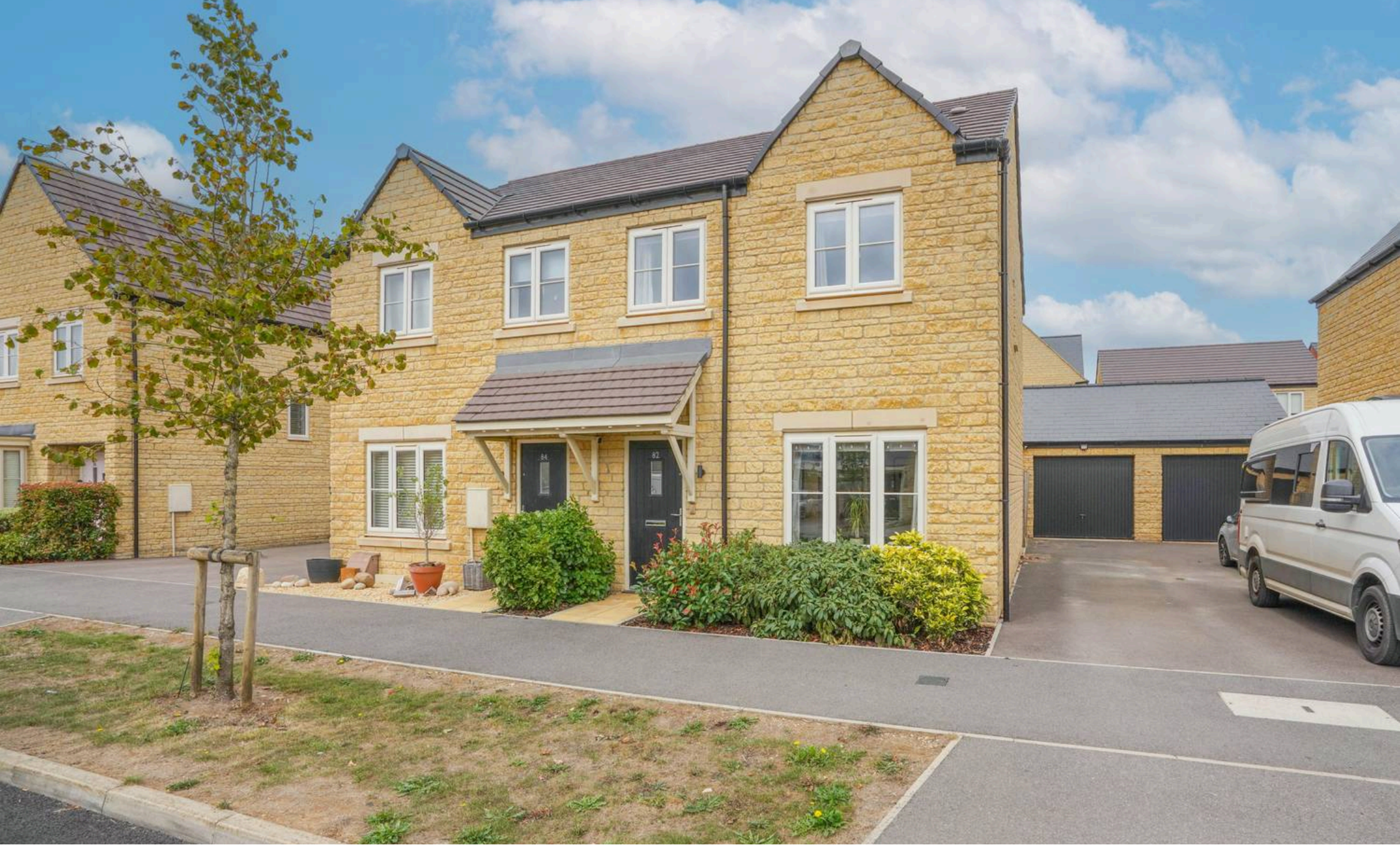
82 Centenary Way, Witney