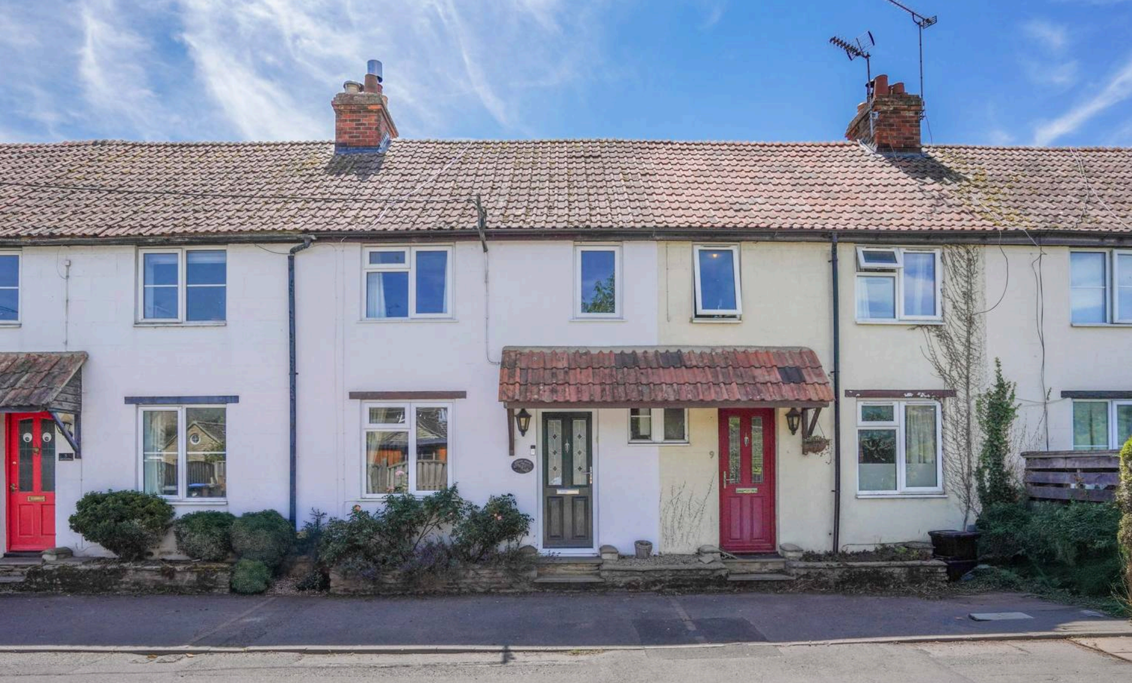
7 Mill Lane, Clanfield