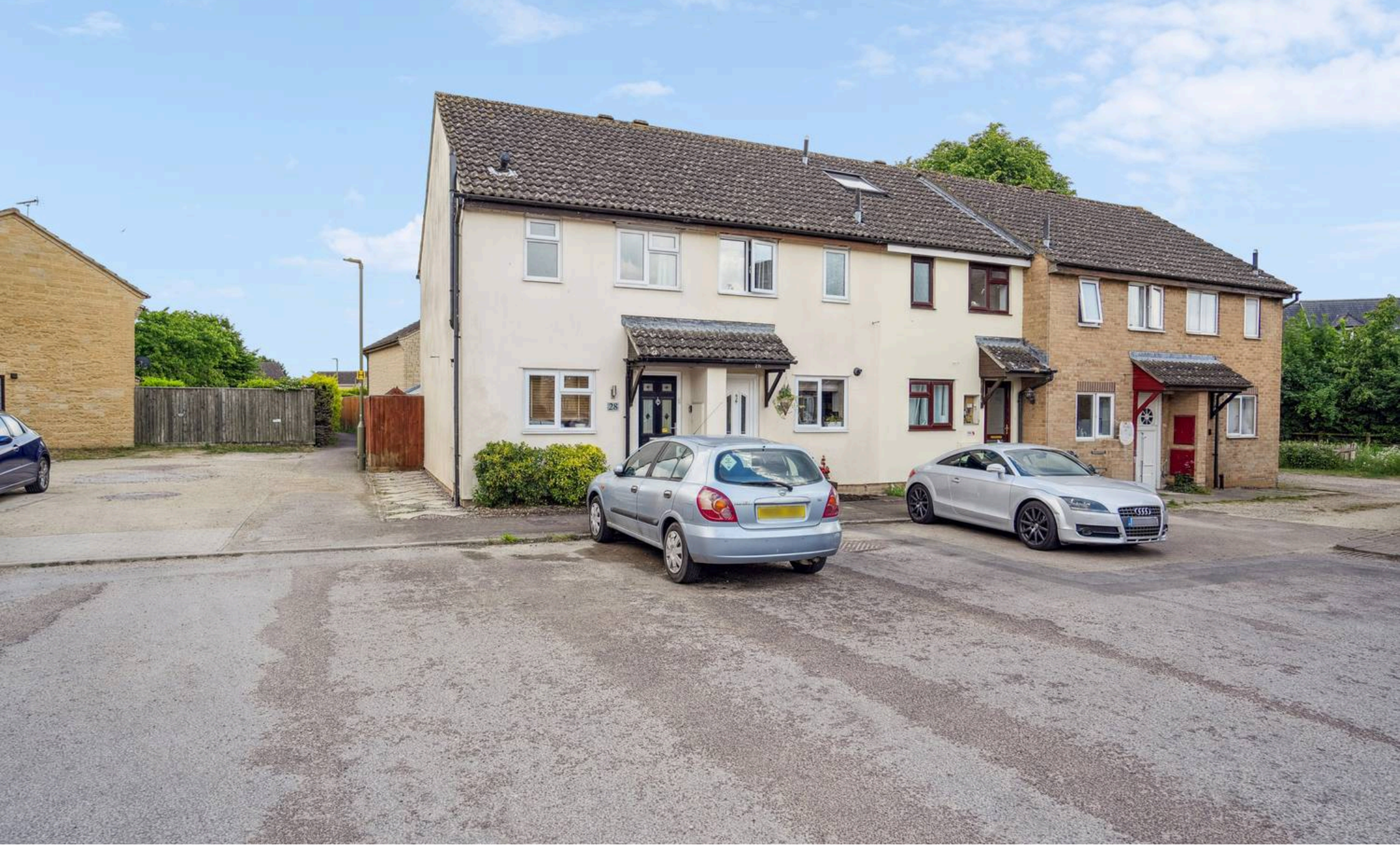
26 Thorney Leys, Witney