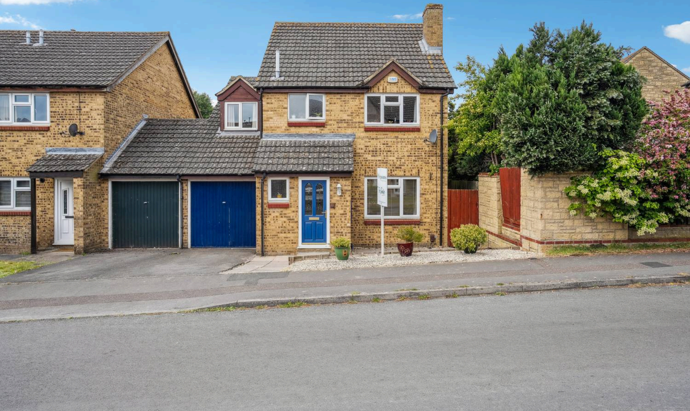
81 Burwell Meadow, Witney