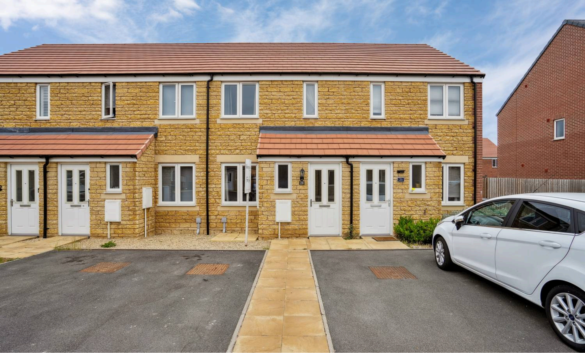
28 Olley Crescent, Witney