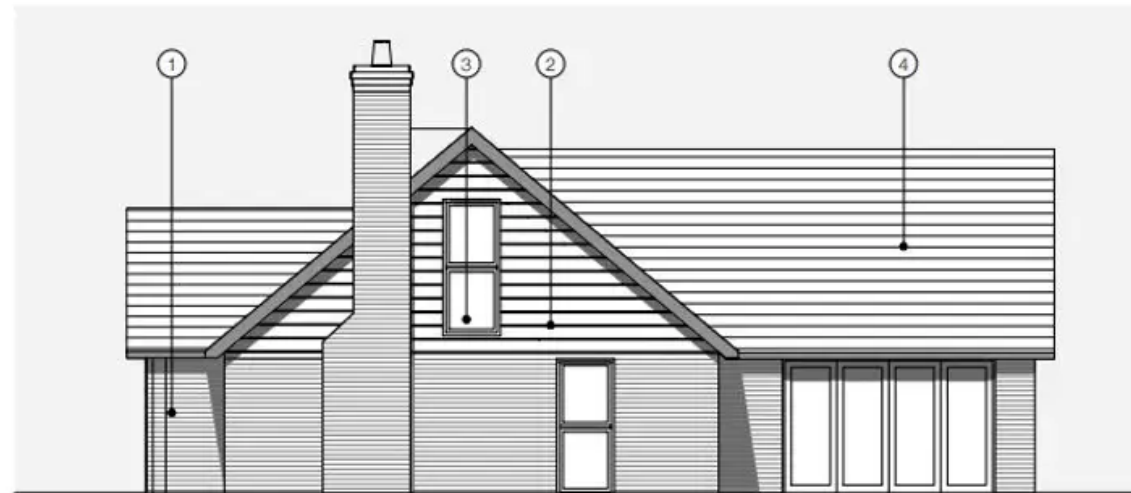
04 - Side Elevation