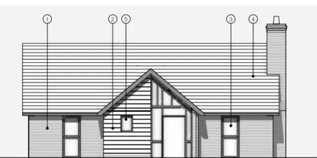
01 - Front Elevation