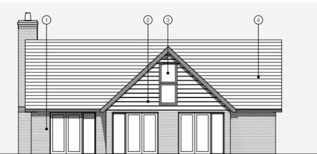
03 - Rear Elevation