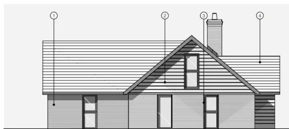
02 - Side Elevation