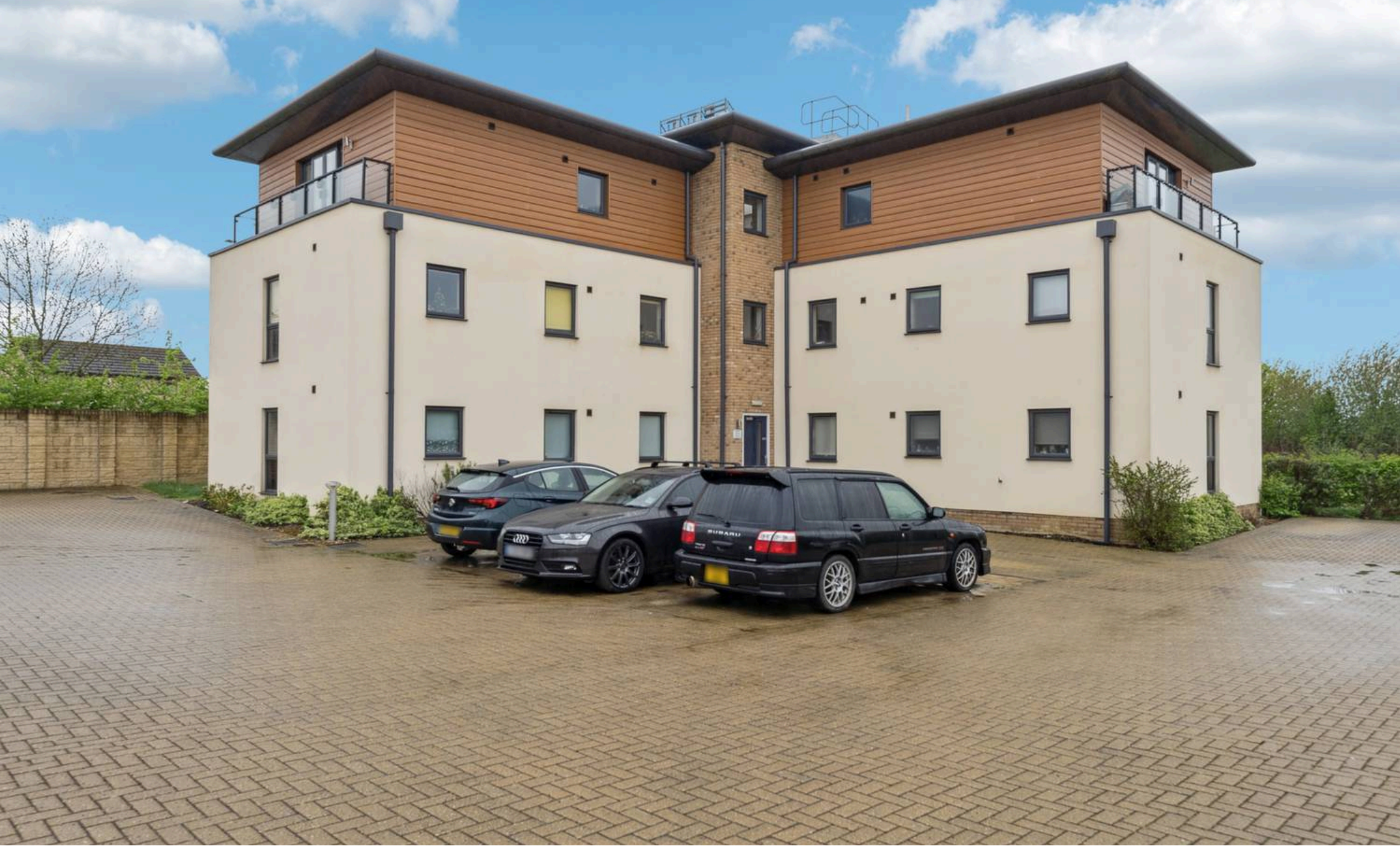
4 Guild Close, Witney