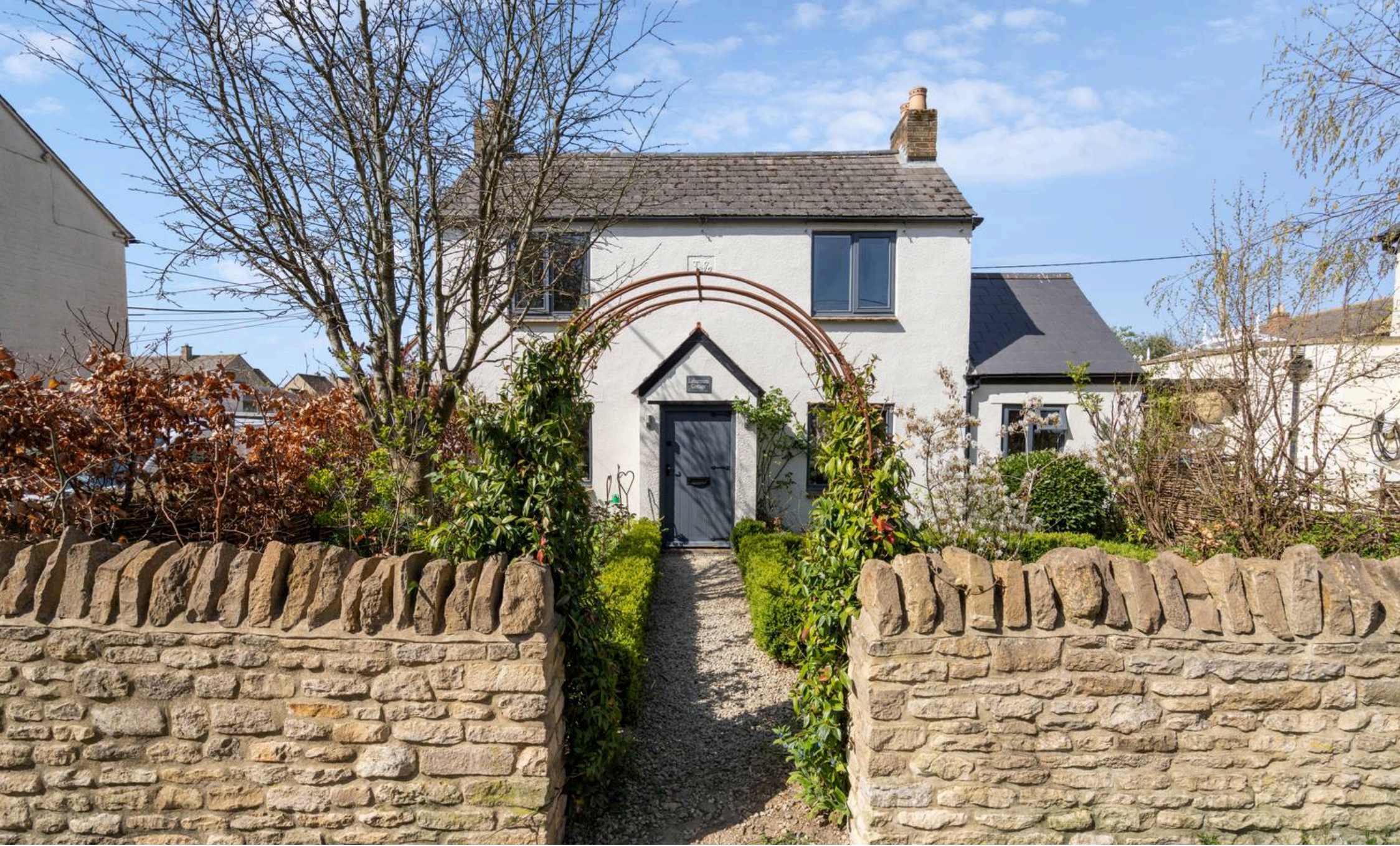
Laburnum Cottage, Main Street, Clanfield