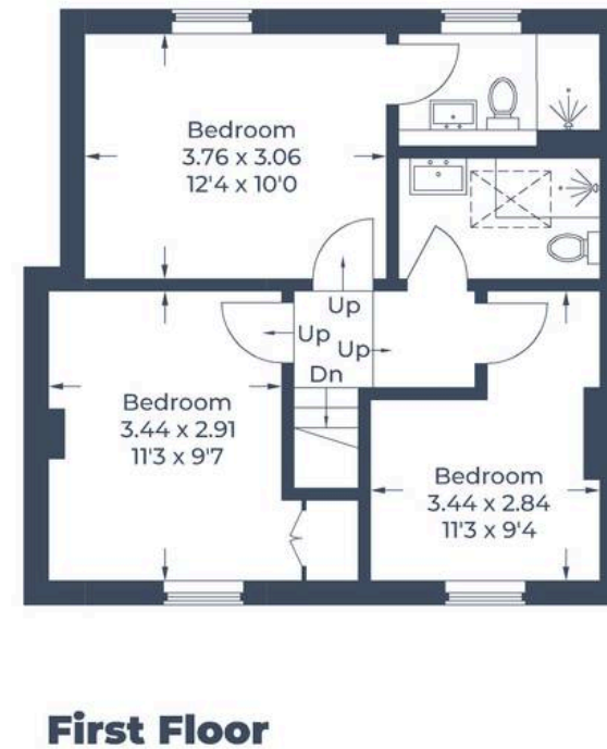
Illustration for identification purposes only, measurements are approximate, not to scale. © CJ Property Marketing Produced for Simpsons