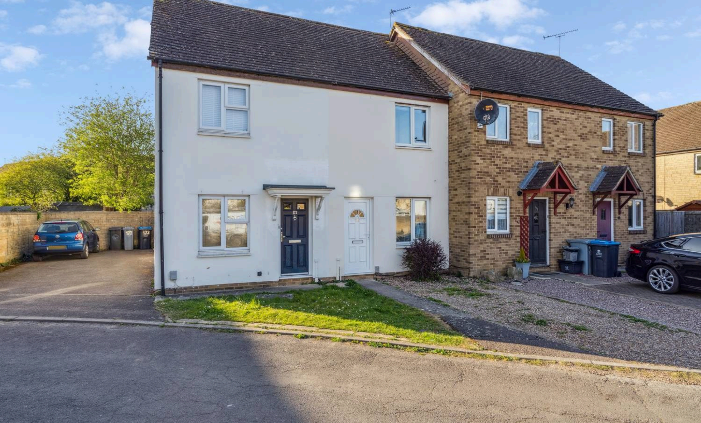
175 Manor Road, Witney