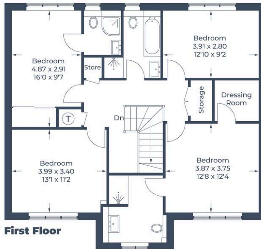
Illustration for identification purposes only, measurements are approximate, not to scale. © CJ Property Marketing Produced for Simpsons