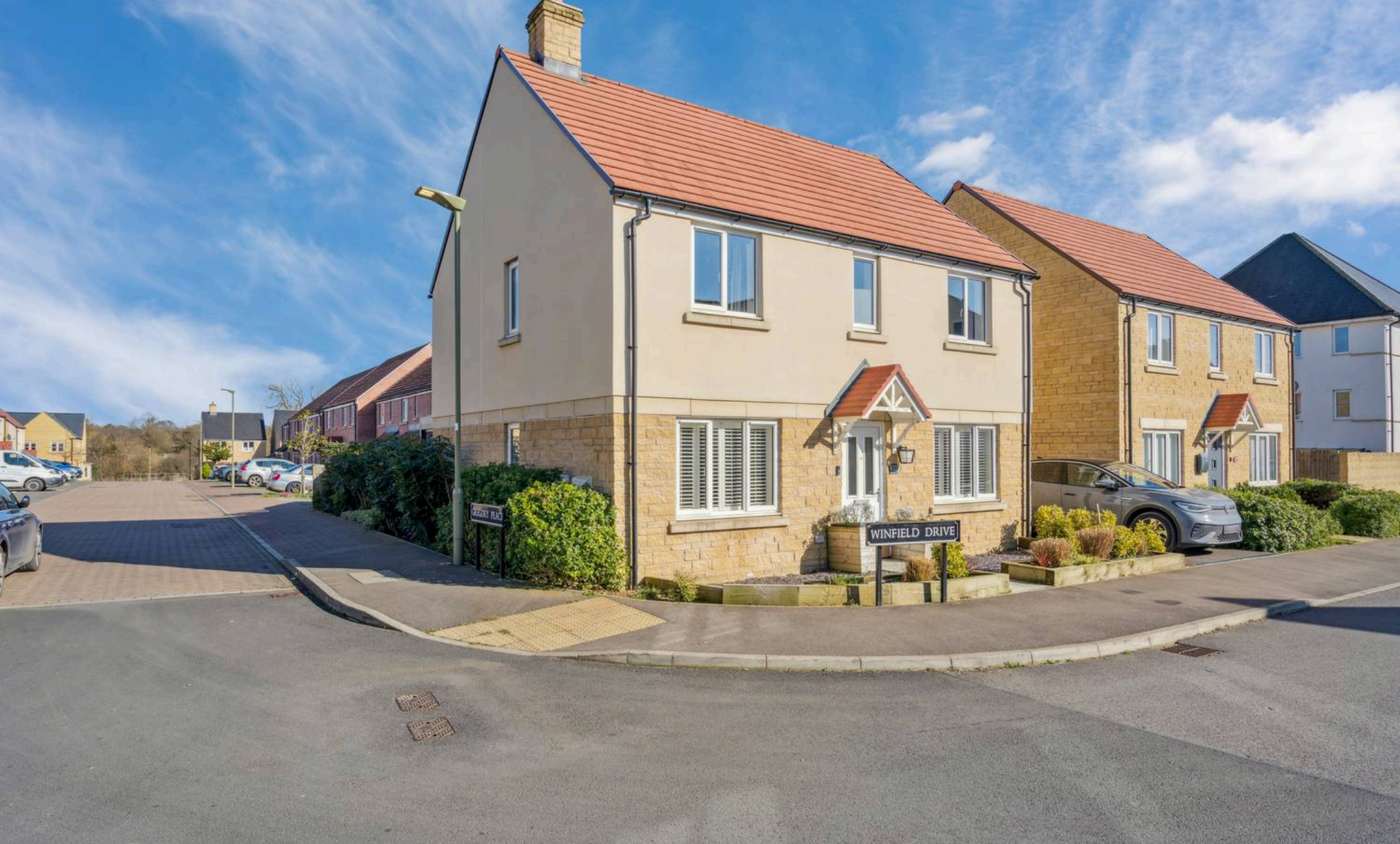
12 Winfield Drive, Witney