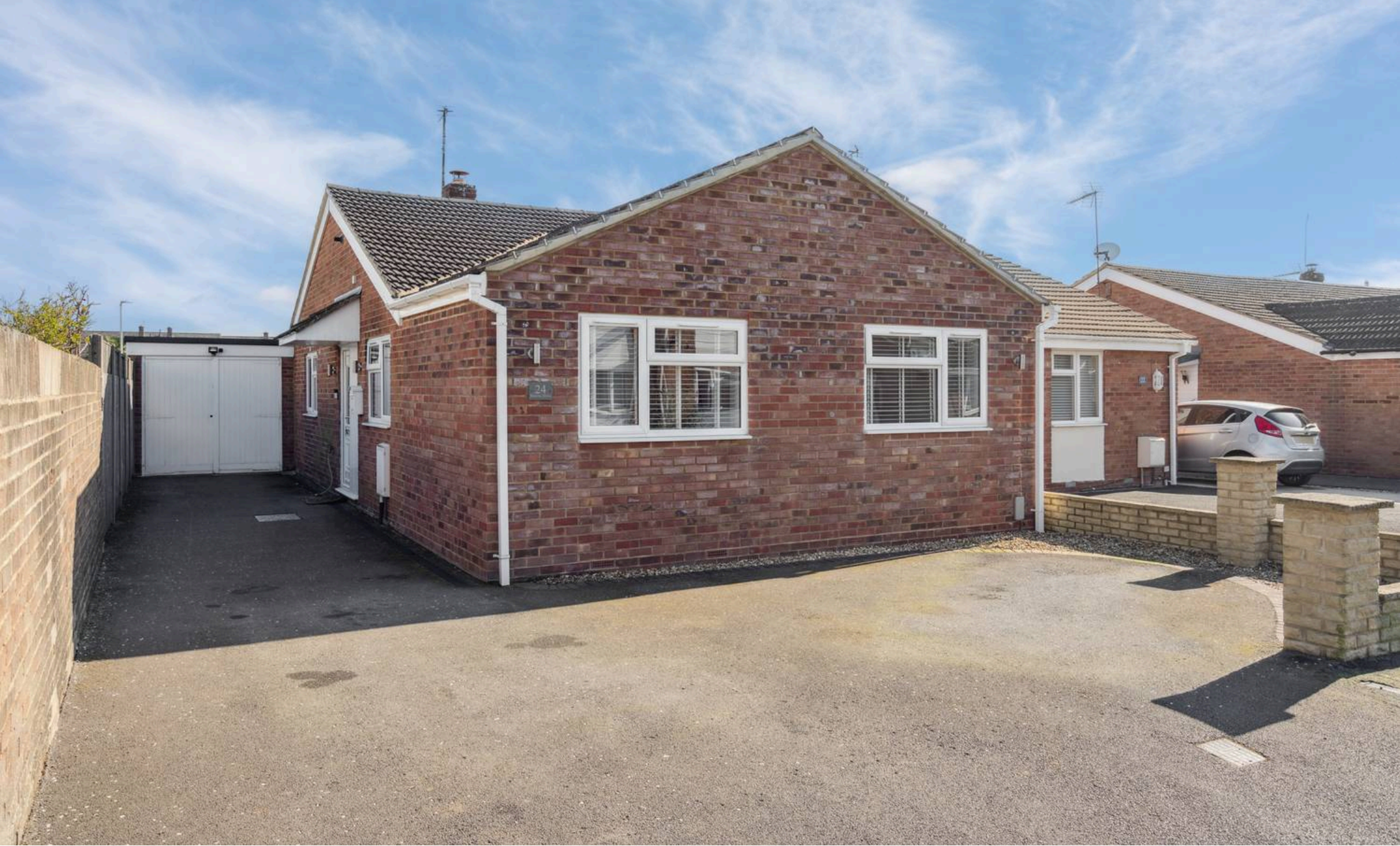
24 Wenrisc Drive, Minster Lovell