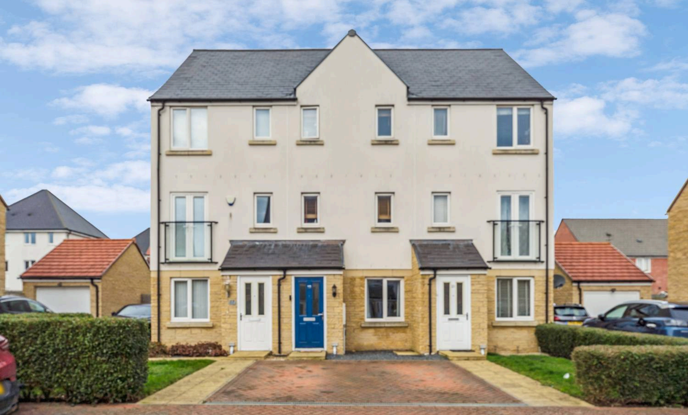
19 Rayson Lane, Witney