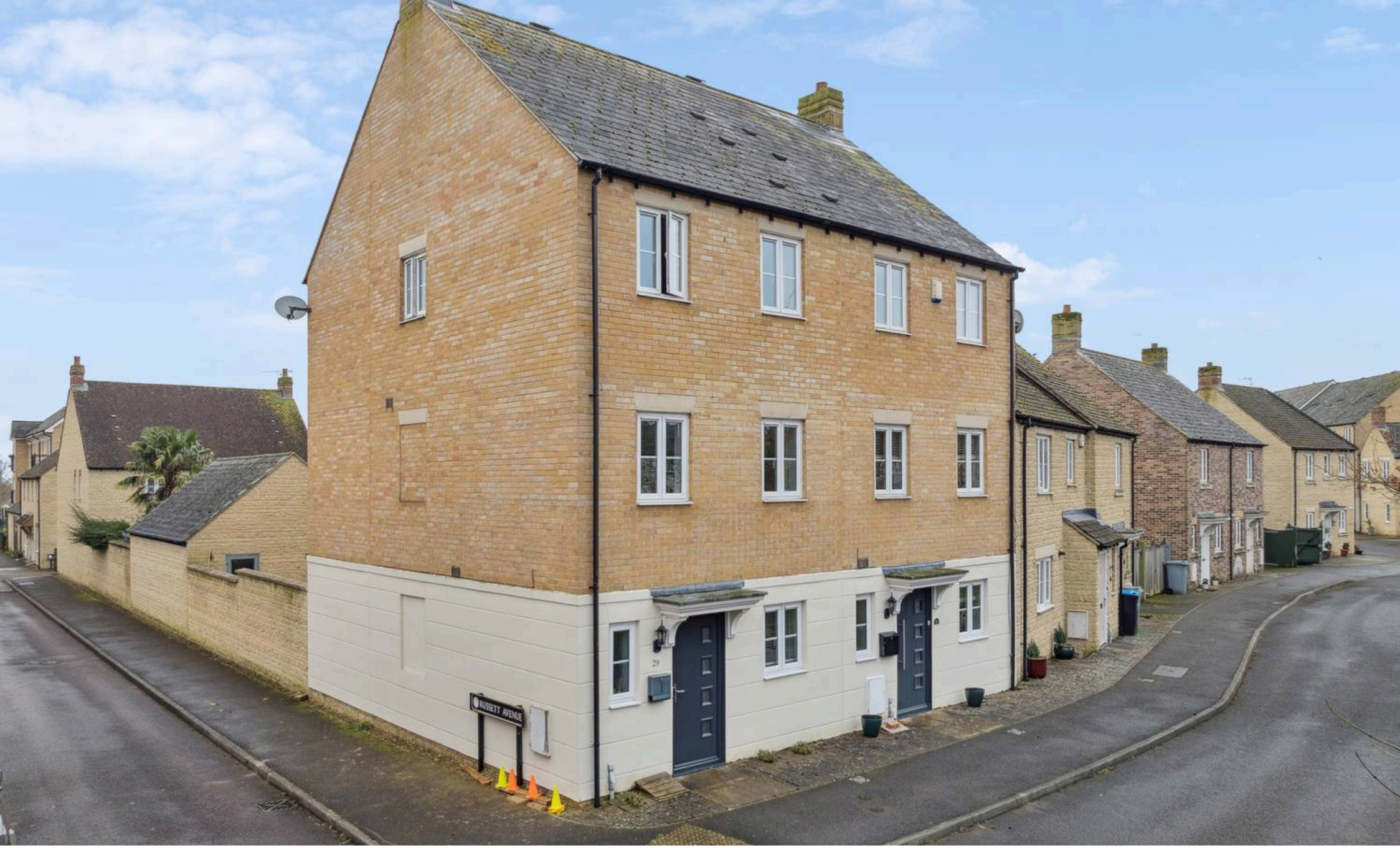
Cedar Road, Carterton