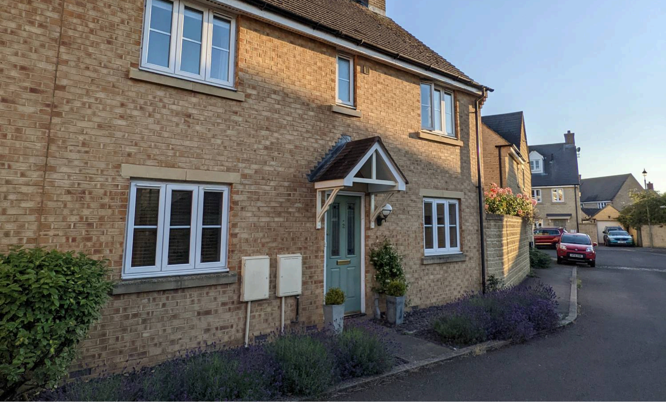
2 Brook Lane, Witney