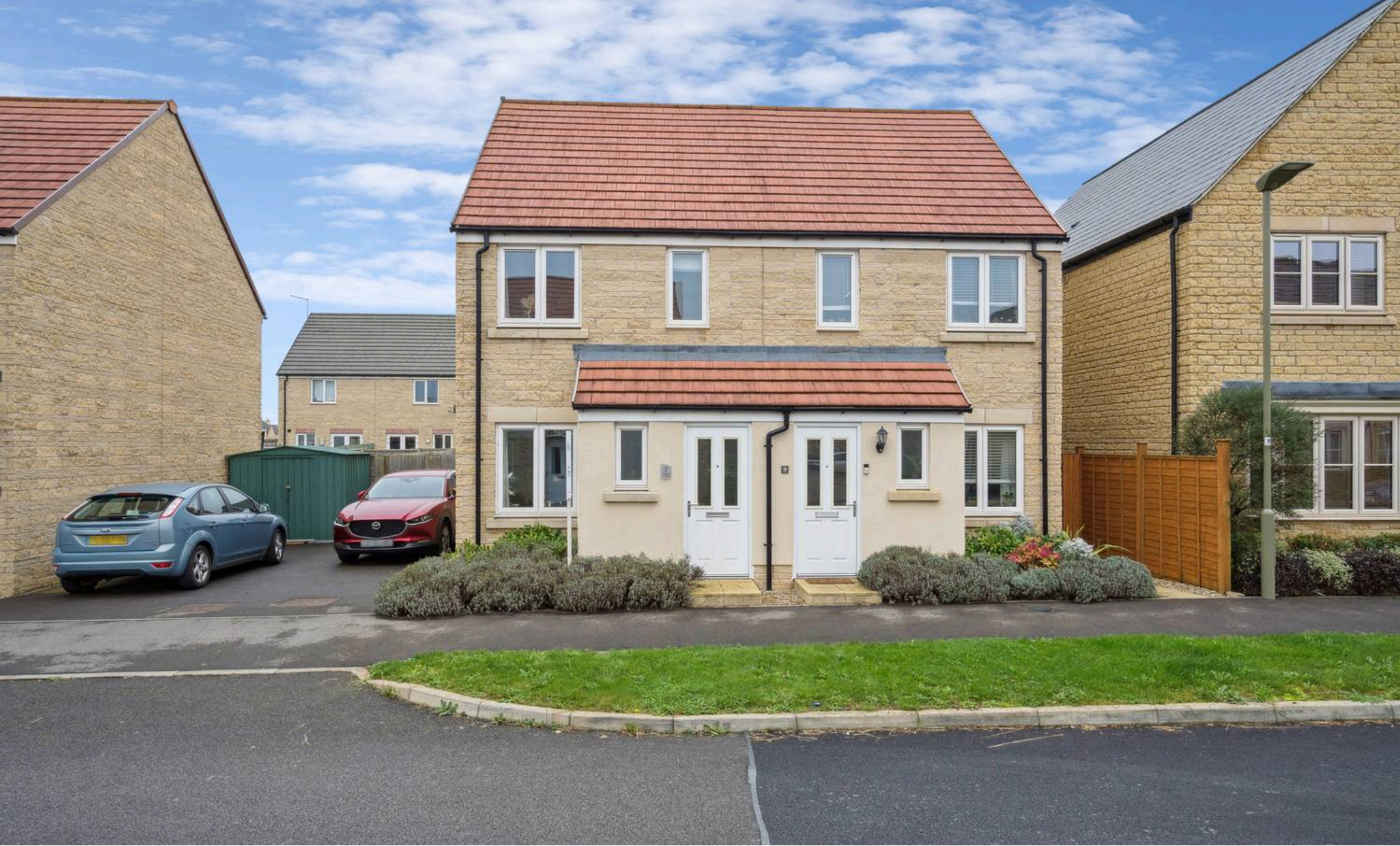
7 Winfield Drive, Witney