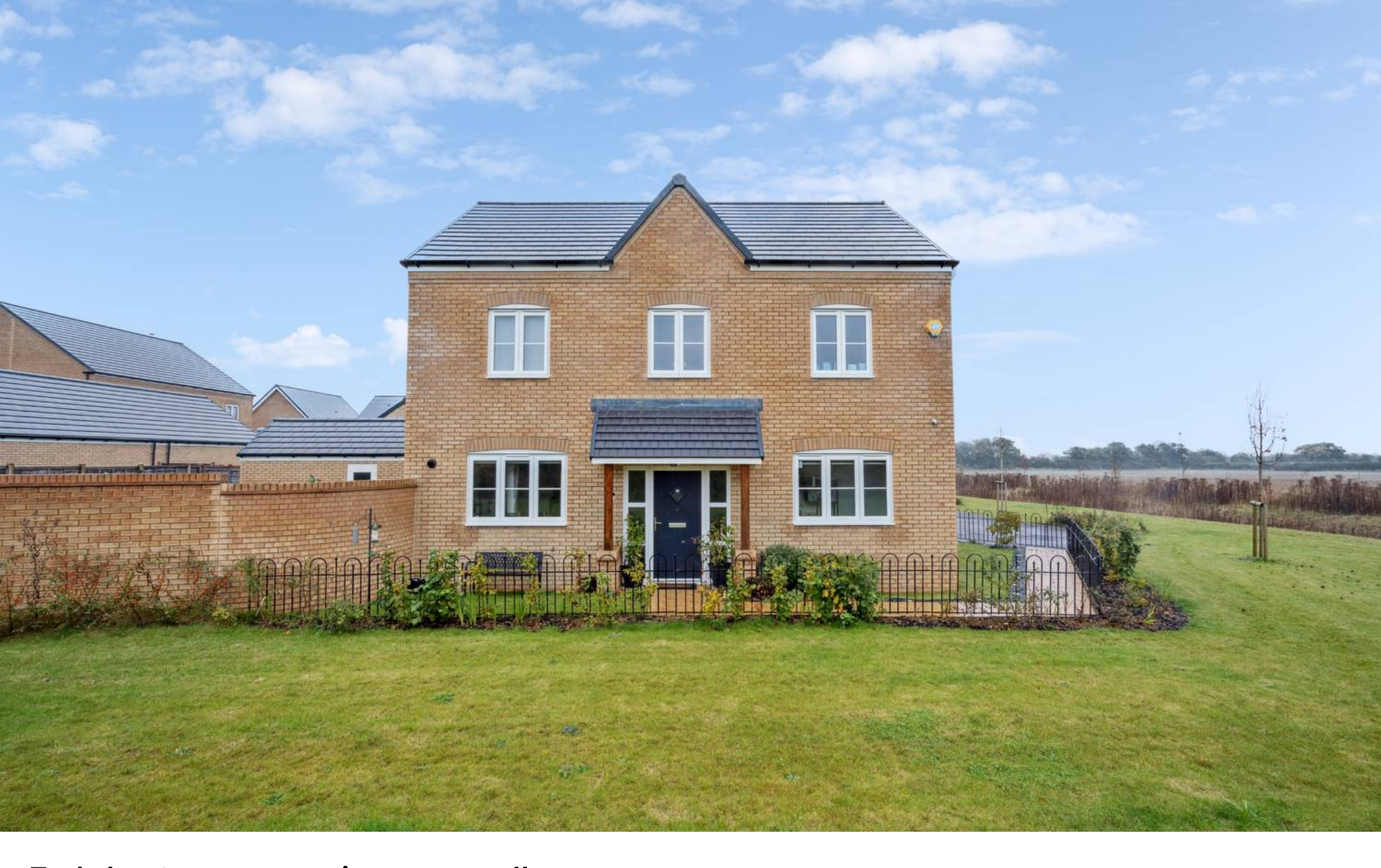
7 Blake Crescent, Minster Lovell