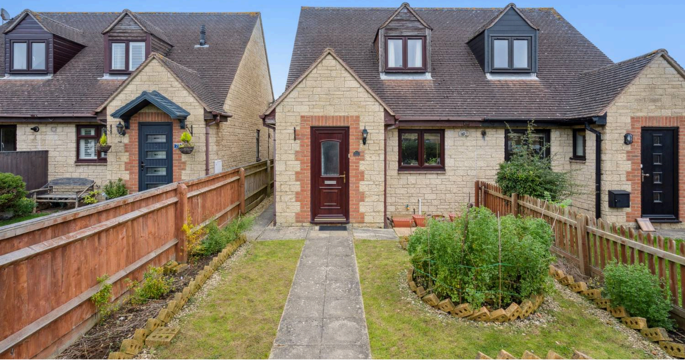
72 Burford Road, Carterton