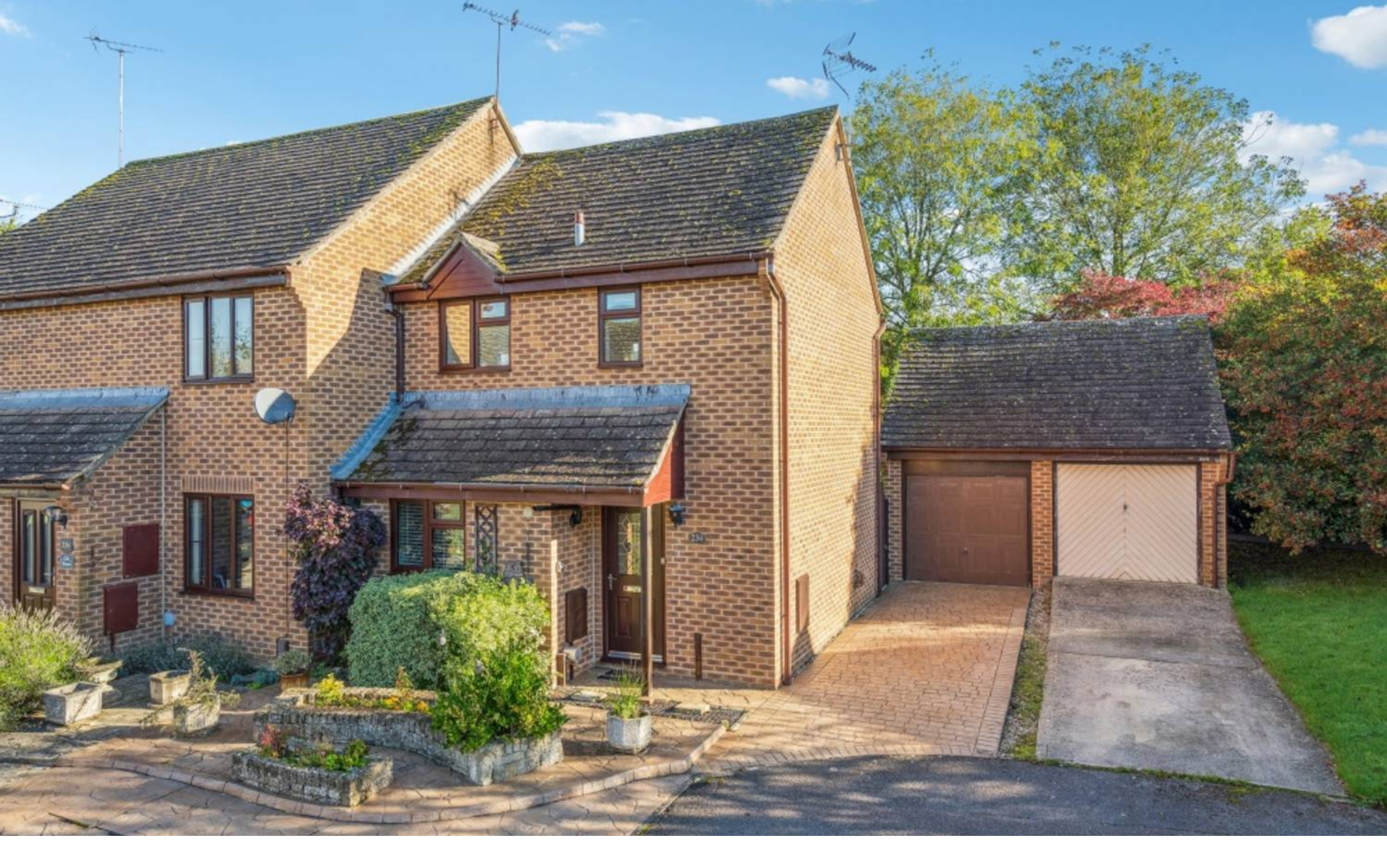
234 Manor Road, Witney