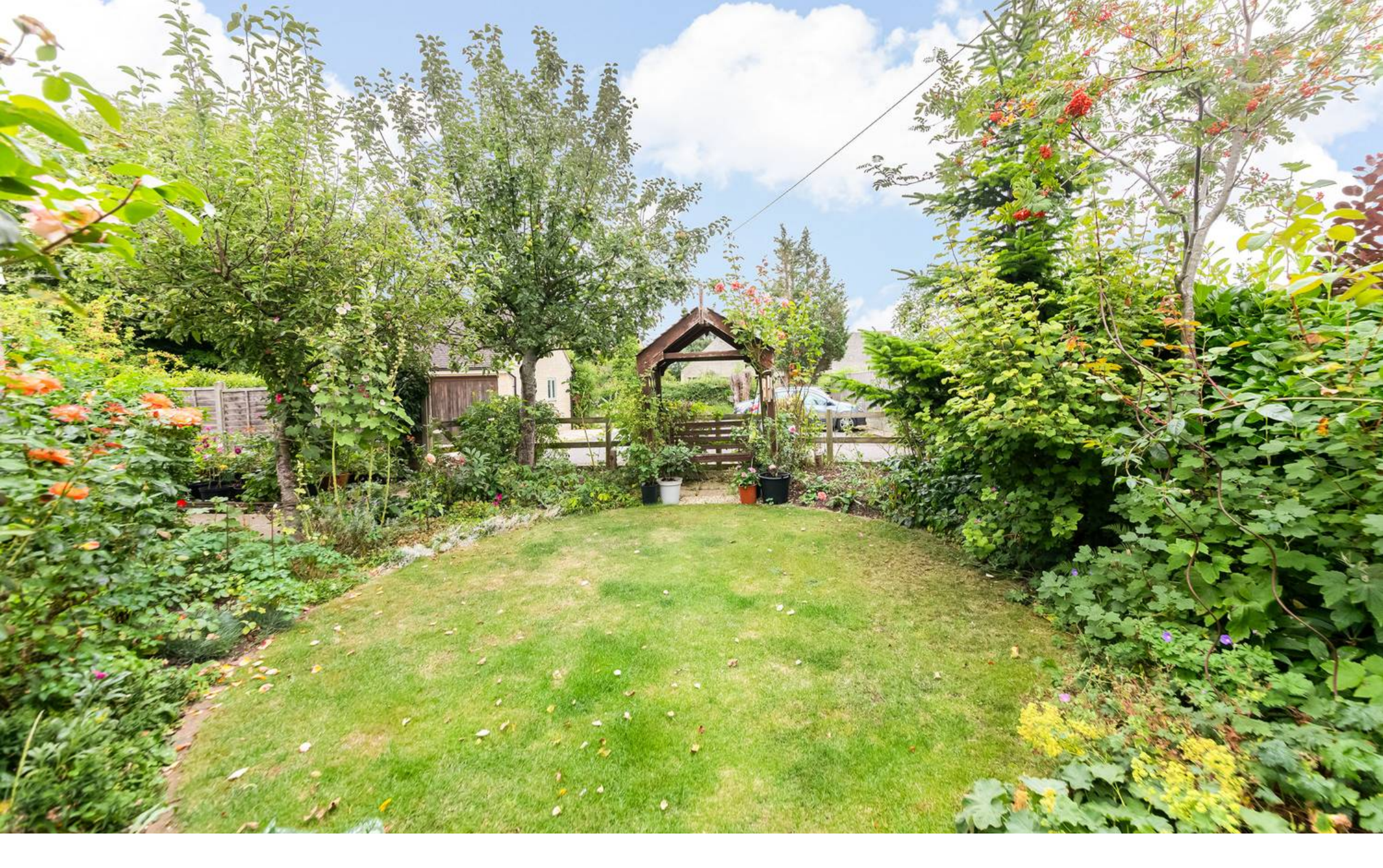
2 Rose Cottage, Sutton